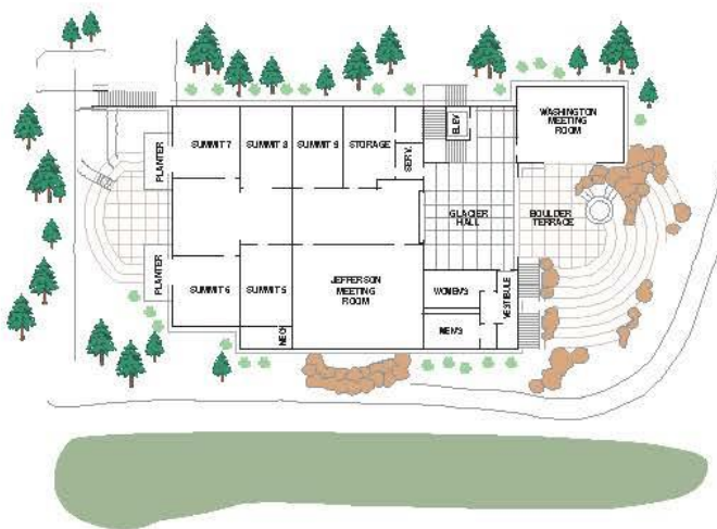
Lower Level Conference Floorplan